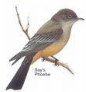
Say's Phoebe (left) Oregon Junco (right)