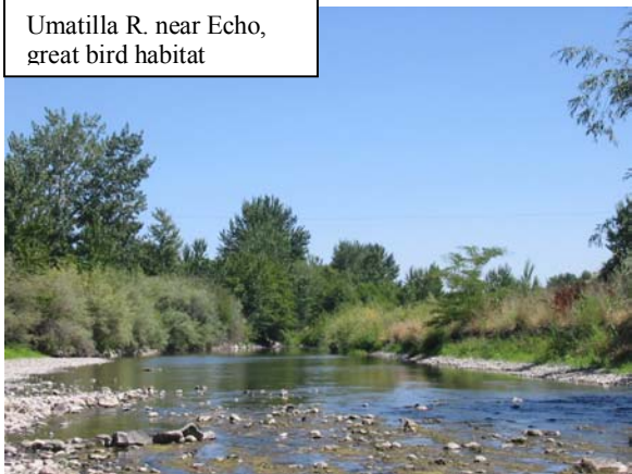
Umatilla R. near Echo, great bird habitat

Trumpeter Swan Gadwall American Coot Cinnamon Teal Canvasback Common Goldeneye Ruddy Duck