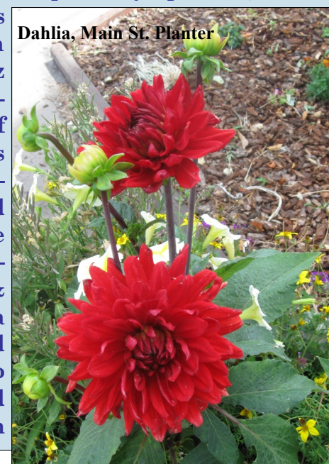
Dahlia, Main St. Planter