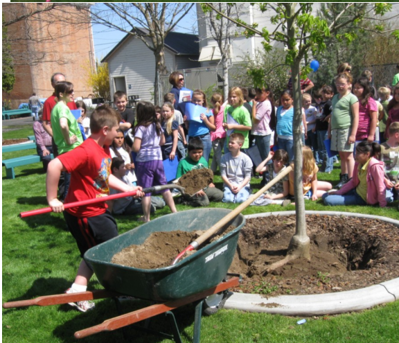
Left: Students help plant the "Echo" Tree on Arbor Day.