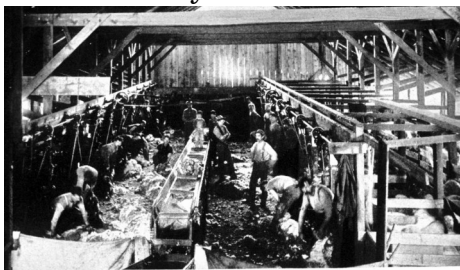
Sheep Shearing on Minor Brothers' Ranch. Eighteen Men A century with Sheep Ranch. Due to the 'Panic' Months

The Echo Museum opened for the summer on May 2 and will be open weekends