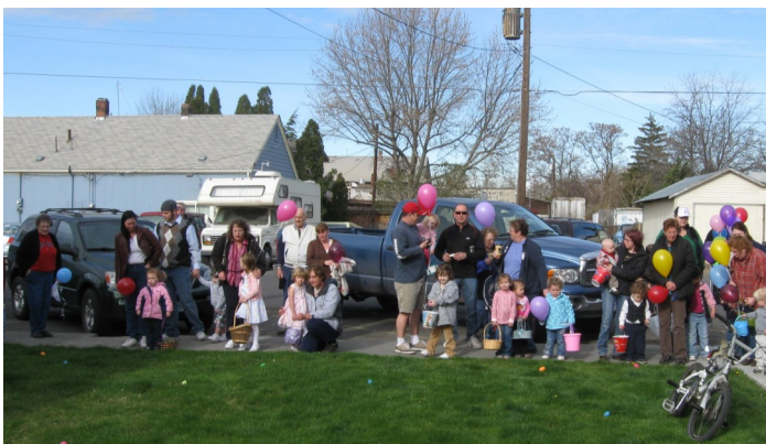
Above: Children line up for the Fire Dept. & Echo Church Easter Egg Hunt.