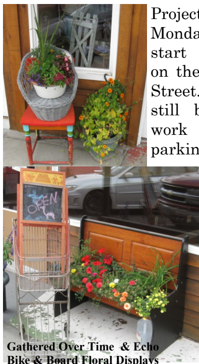
Gathered Over Time & Echo Bike & Board Floral Displays

Goodfellow Bros., Inc., General Contractor for the Echo Downtown Project will begin work on Monday July 9, They will start removing sidewalks on the south side of Main Street. All businesses will still be accessible while work is underway, but parking on Main Street may be limited. The contractor hopes to complete most of the work in September, except for street trees and installation of pavers around them. Planting conditions for the large 3" caliper trees and survival rates should be better in October.