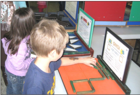
OMSI Science Fair in Oct.