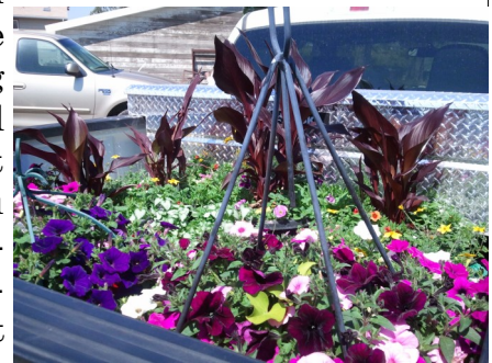
Flowers coming from the Kopacz Greenhouse 2012

It is time to start planning for America in Bloom this year. On the final page of the newsletter you will find some photos showing projects posted on Pinterest Boards that you may find inspiring. We will continue to post links and information to help residents this year.