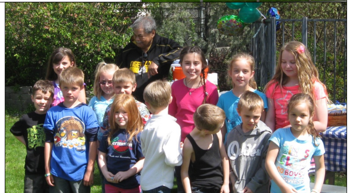
Winners of Arbor Day Tongue Twisters & Poetry Contests