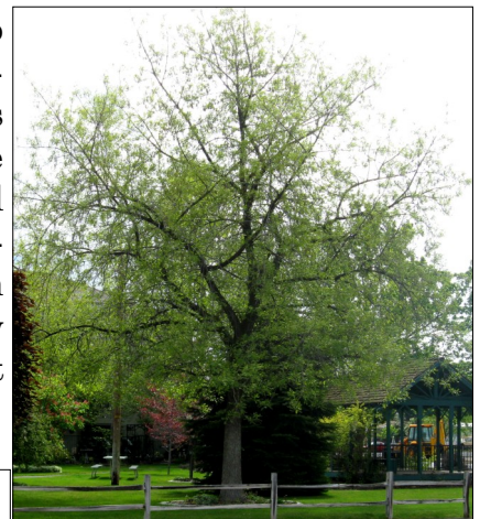
R. Bur Oak in city park

3. 50/50 program: Residents can purchase a tree half price (usually $11 to $22). One per resident. Two trees are still available a Radiant Red Bud ($15) & a Columnar Hornbeam (same as new Main Street Trees) $21.