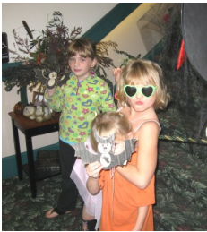
Story /CraftTime Fun: Making Bats!!, Story Time Fridays at 2 pm