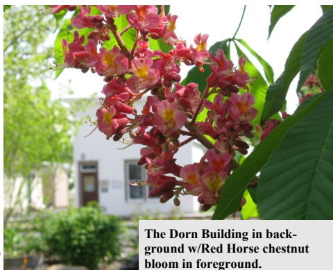
The Dorn Building in back- ground w/Red Horse chestnut bloom in foreground.

(cont. from pg 1) business- men in turn- of-the century Echo. Bennie Tolar in her book Echo's from the Past , has a biog- raphy of Fred's Dad