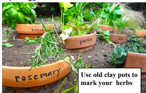
Use old clay pots to mark your herbs

It's also exciting to consider that we have a good mix of small and medium-sized cities this year, with a number of first-time communities. Obviously, word is getting out about the AIB program and the good results communities are realizing from participating.