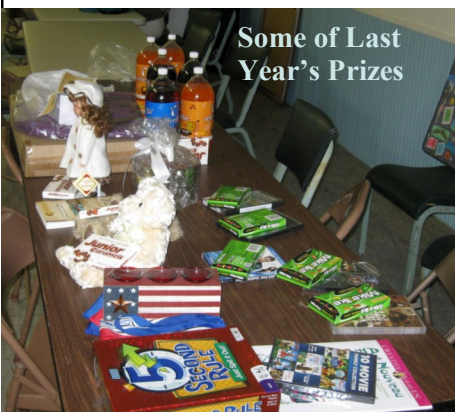
Some of Last Year's Prizes

Awards for the annual Echo Beautification Contest will be presented. NNO events rely on your donations. If