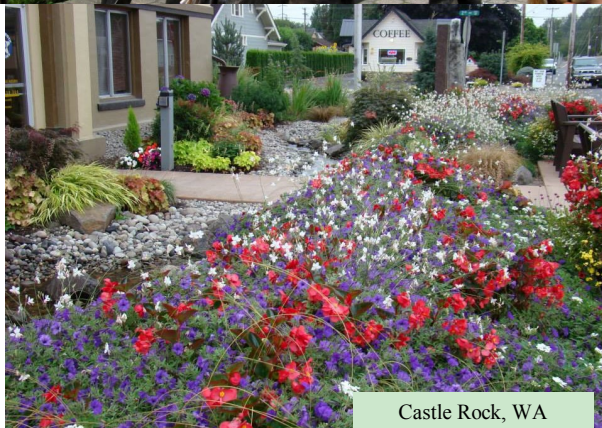
Castle Rock, WA