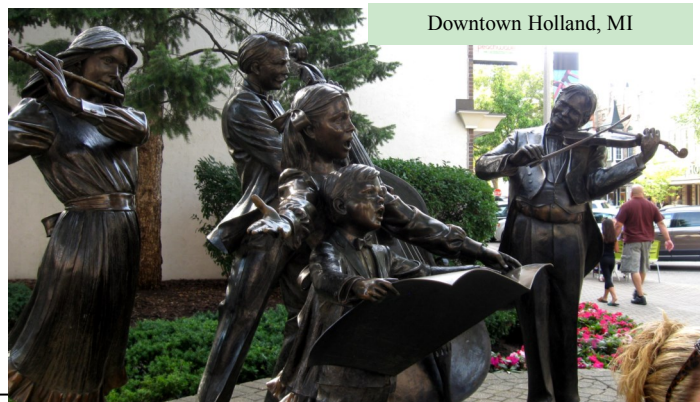
Downtown Holland, MI

In reviewing the Judge's evaluation of Echo we can see that our lower scores are in the commercial and residential areas. Excerpts from the evaluation are printed here. Copies of the report can be picked up at city hall.