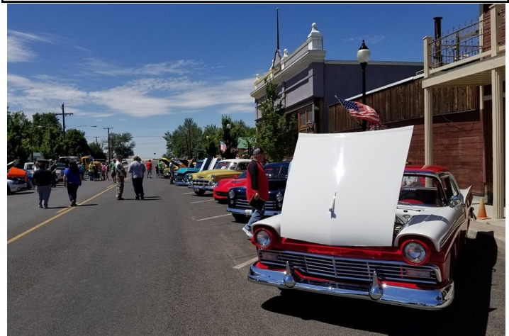
Photo of 2018 A.C.E. Car Show

Kayak Transportation will be starting a trial run of one of its Hermiston buses probably beginning in July. The bus will not cross to the west side of the railroad tracks and the pick up site will be announced later.