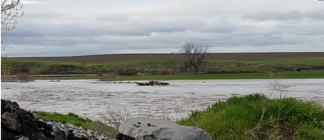
Flooding 1906, 1913, 2009 & 1960s